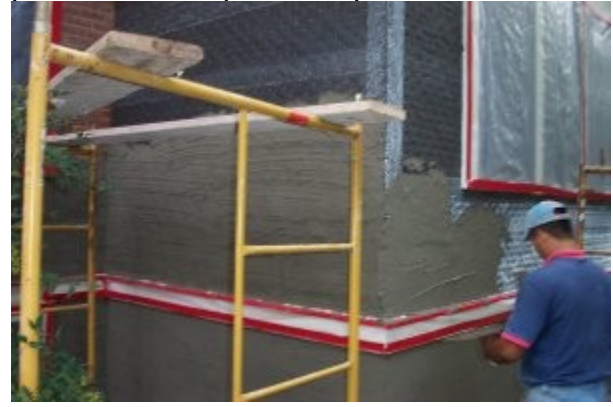
3 inch over laps.

The standard for the minimum overlap for metal lath is one inch, but I say, why be cheap?, go 3 inches. Note how the inside and outside corners are reinforced with strips. There is a pre-made material for this called cornerite, which is pre-bent strips of lath. Crack resistant work begins with good lathing