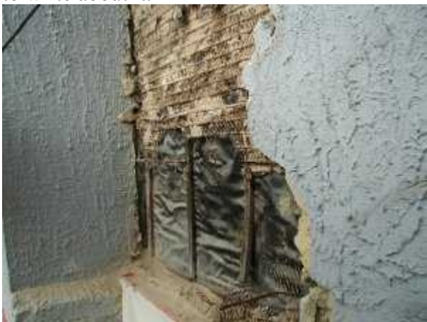
Furring strips don't work

I saw another method that worked, but was so strange, I am not going to write about it.