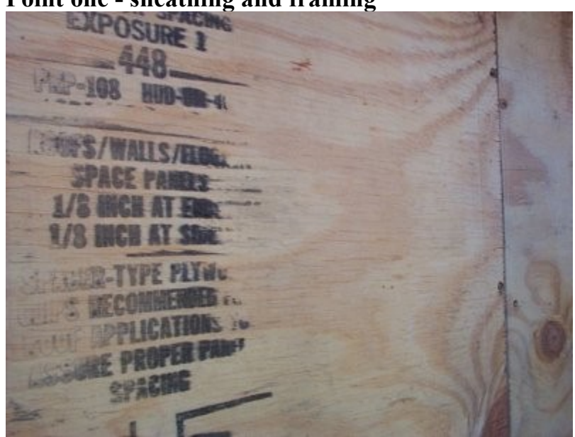
Stamp on plywood says space 1/8" at ends and sides. Next to stamp is joint butted so tight you can't stick a razor blade in it.

A large source of cracking in stucco is the movement, warping and expansion of plywood or OSB sheathing. The American Plywood Association recommends spacing of 1/8" at ends and sides of plywood and OSB panels. "If severe moisture conditions are anticipated, increased spacing may be required." The buckling caused will crack the stucco, not necessarily at the joints, but anywhere. If this wasn't important, the plywood manufacturers wouldn't waste the money on stamping every sheet. All I can do is insist that the plywood be spaced 1/8".