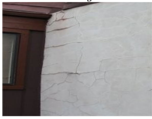
Badly cracked up and loose stucco caused by leaking roof cap