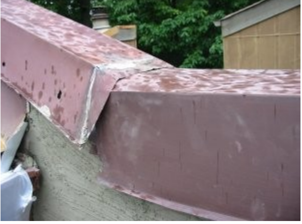
Bottom cap is removed and pushed under the upper cap. The overlap prevents water if the bottom piece was put on first, 30 years ago.

Protecting the work after it's finished is out of the control of the plasterer. All I can do is insist that things like roof caps are done, but I don't put them on. The material we work with lasts pretty much forever, as long as water doesn't run behind the wall.