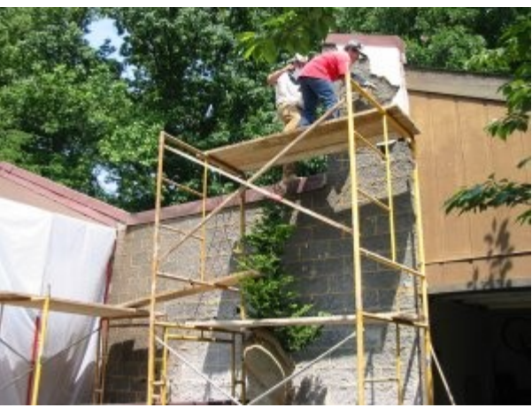
An ounce of prevention is worth 3,000 lbs. of cure. Whole wall is stripped down to block. This assures a nice job. Patches almost always show.