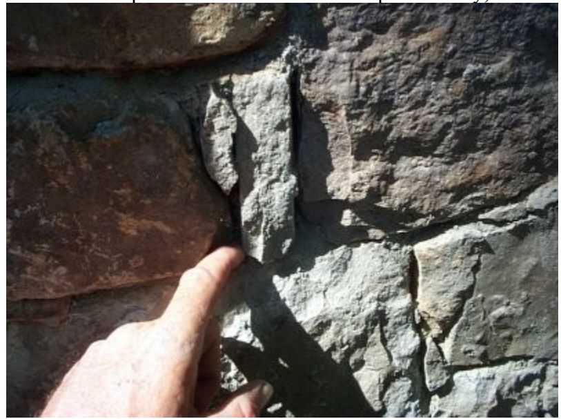
Portland cement mortar can be easily scraped off with a finger. Mortar in the stone work on this multi-million dollar house was constantly retempered

When mortar is set to the point that it is "chunky", it should be pitched. Plaster brown mortar can't be retempered, and has to be pitched. As a plasterer, we learn methods to extend the working time of plaster, such as using clean water to mix with. Dirty water makes plaster set faster, and does the same for cement mortar. It hurts me to see bricklayers wash their shovels, etc. in the same water they mix with. Their mortar has to be retempered often to maintain workability, not only weakening the mortar, but it is a complete waste of time. Time equals money, remember?