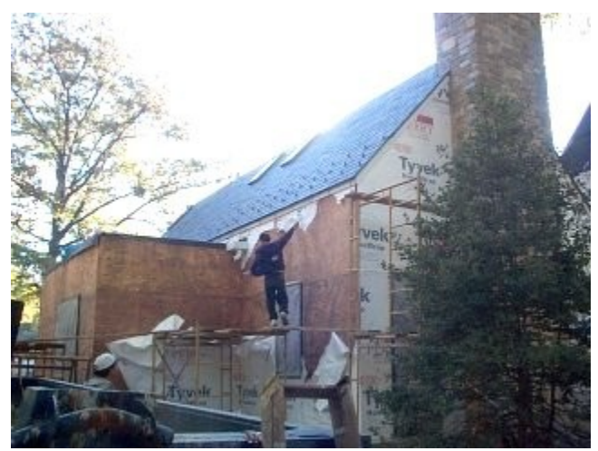
Tyvek is easily torn off and felt paper applied

I got an e-mail message from a third generation plasterer saying that tyvek causes awful cracks. <u>Click here</u>. This set off an alarm in my head. The jobs we did that had excessive cracking all had tyvek.