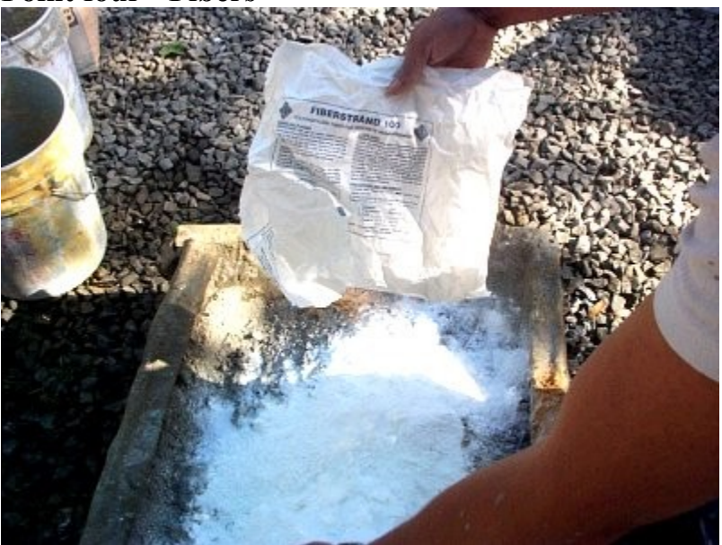
Reinforcing fibers made for concrete work for stucco, too.